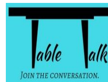
Table - January 17 - Meal: 6:00 p.m. in the Family Life Center gym ($4 per person/ $15 max per family). Discipleship Groups: 6:45-8:00 p.m. for children, youth, and adults! (Nursery provided for pre-K). This week's meal: Baked Spaghetti. No reservations needed. Hope to see you there!