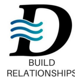
Table Talk - Wednesday, November 1st at 6:00 p.m. in the Family Life Center. Menu: Taco Bar, as well as PB&J for the kids and kids at heart! Cost: $4 per person/$15 MAX per family/ Children under 4 - FREE. Bring a friend with you!

This is the third week of our series called "Sticks and Stones Are Not the Problem." The concept comes from the children's rhyme, "Sticks and stones may break my bones but words will never hurt me." This rhyme is a blatant lie. Words are often the most painful weapons we can use against each other. How many of us are carrying deep and hurtful wounds caused by someone's malicious words uttered years ago. This series is a reminder that our behavior matters and through Christ we are called to pay close attention to what comes out of our mouths as a leading indicator of what is in our hearts.